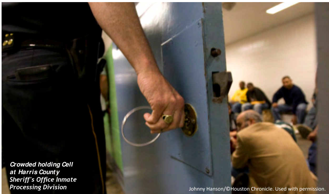
Crowded holding Cell at Harris County Sheriff's Office Inmate Processing Division

Despite being home to the largest jail in Texas (and third largest in the United States), Harris County has nonetheless struggled with jail overcrowding for the past four decades. In 1974, a group of inmates filed a lawsuit against the Sheriff and County Commissioners that challenged the conditions of their confinement; it culminated in a federal court order condemning the overcrowded conditions in the Harris County jail, and it provided jurisdiction to the federal court to ensure steps were taken to bring the conditions of the jail within constitutionally protected standards. 3 For nearly two decades, that court wielded its oversight power heavily, frequently intervening to prevent conditions at the Harris County jail from deteriorating further. And yet, following the termination of the court's oversight in the mid-1990's, the Harris County jail population once again swelled.