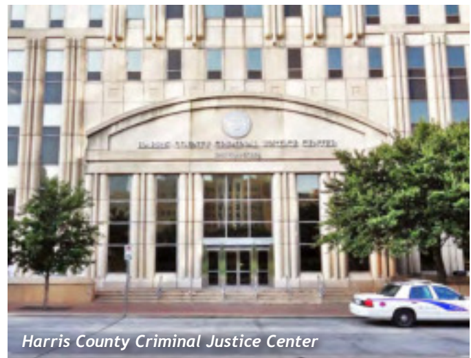
Harris County Criminal Justice Center

This lack of a cohesive, county-wide data system is inefficient and impedes timely, well-informed decision-making.